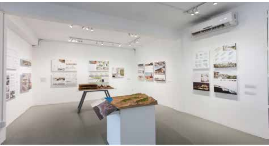
You Are Here: Urban Approximations