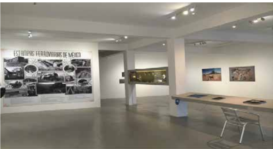
Todo viaje es espacial SEFT-1: (Sonda de Exploración Ferroviaria Tripulada)