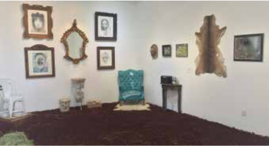
Gil Garea: Del acstracto ranchero al naquismo mágico