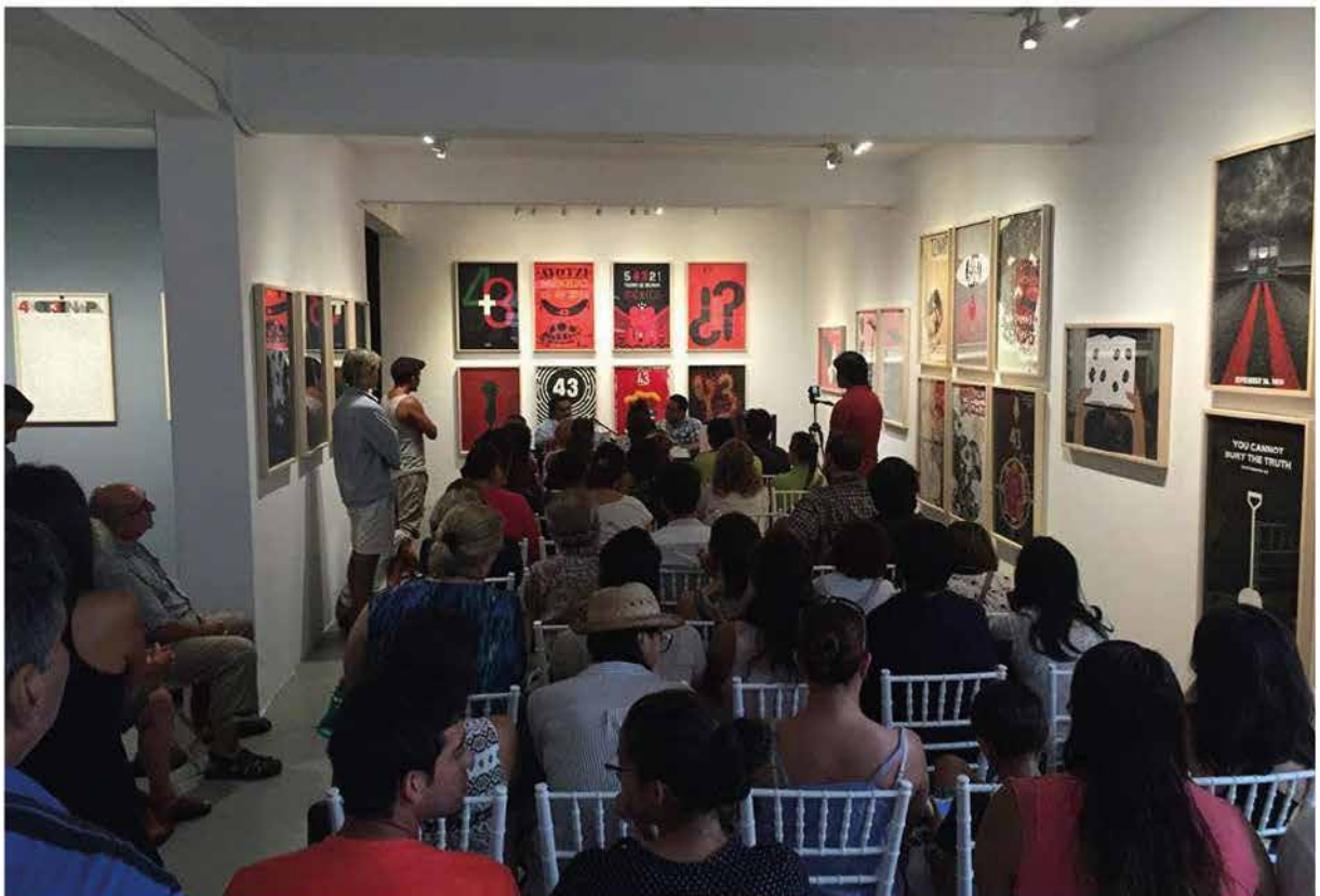
“Art and Activism” conference.