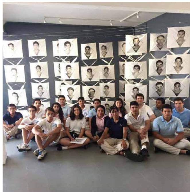
School visit at OPC.