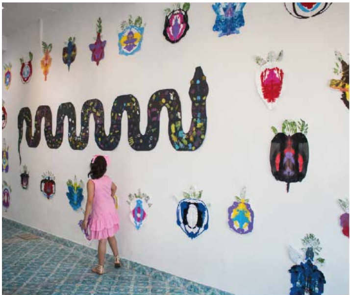
Workshops for children related to the current exhibition on display.