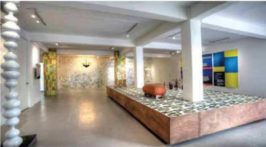
Ideal Standard: A Social Franchise Model for the Production of Utilitarian Art Multiples

OPC recently had the honor of being included in the book Contemporary Art in Mexico: A Guide to Galleries, Museums and Alternative Spaces , published by Editorial Travesías.