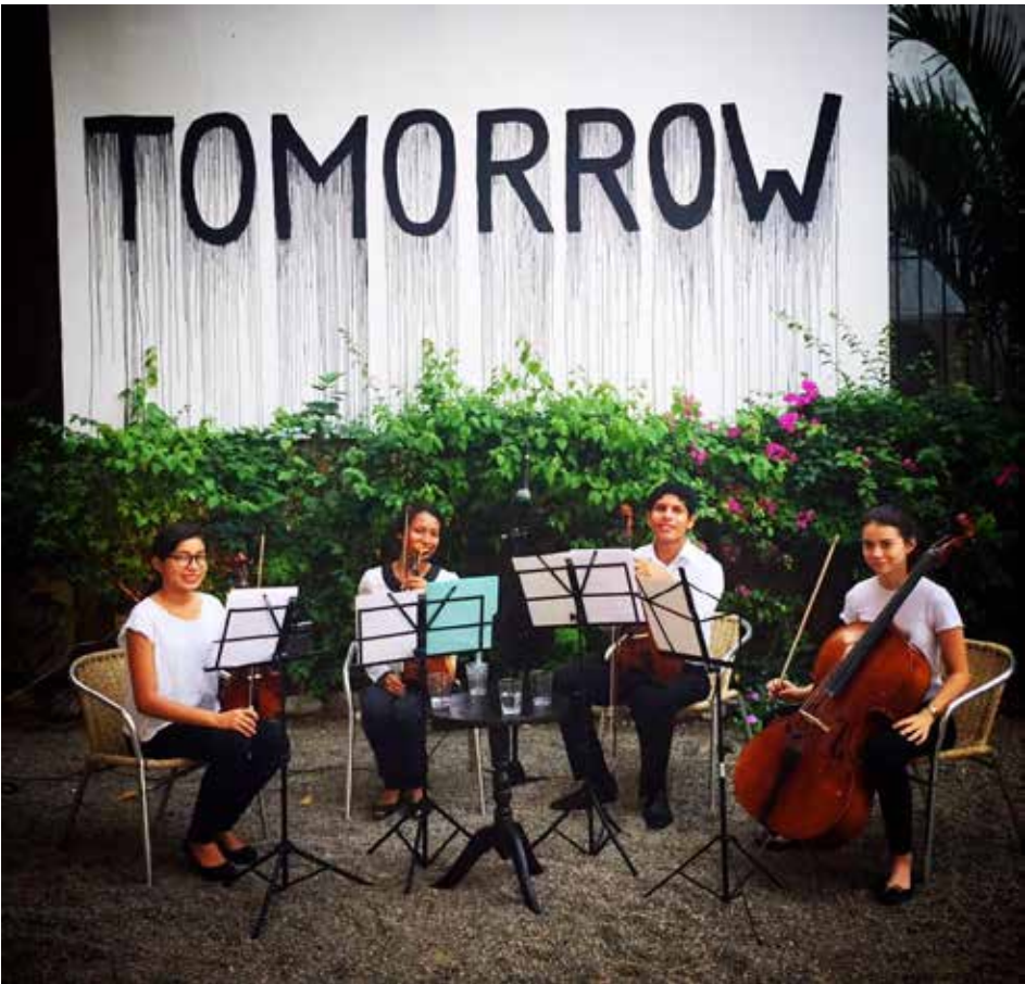
Cuarteto de Cuerdas PVCO during their performance at the Garden.

Since the opening of the OPC Educational Garden — thanks to the support of Martha and David Haynes — we have sustained our efforts to increase the public flow and therefore, we maintain constant activities from Wednesday to Friday. This strategy has had a positive direct effect on the increase of people interested in learning more about contemporary art. Currently, people come regularly to the OPC headquarters throughout the day looking for the activities we propose. The Educational Garden has also become a space for children in the community to visit after school, read books and visit the exhibition space. They have taken over this space of contemporary art that is made for them.