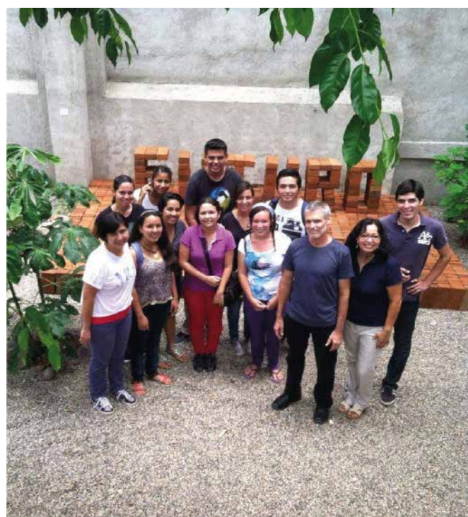
School visit at OPC.